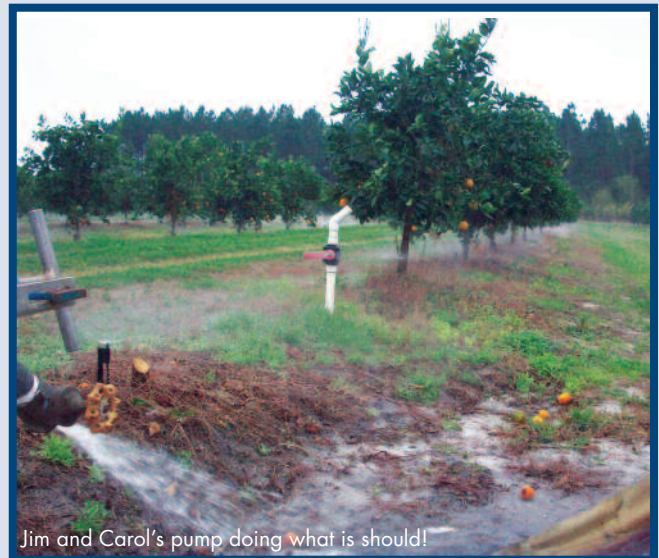
Jim and Carol's pump doing what is should!